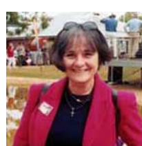
Senator Claire Moore