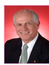
Senator Russell Trood