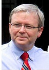
Prime Minister Australia