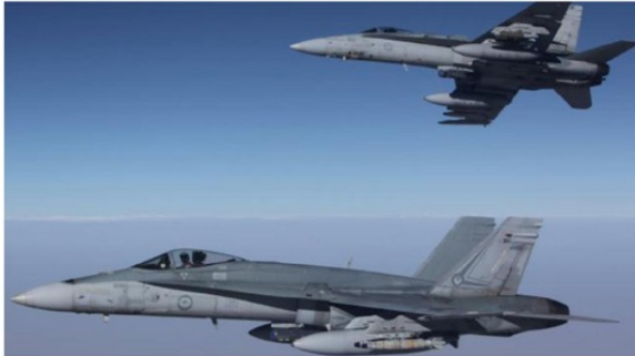
Strike wing... F/A-18A Hornets from Australia's Air Task Group fly in formation during the first mission of Operation OKRA to be flown over Syria.