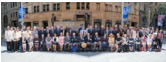
UN Day Wreath Laying Ceremony 2014

The Cenotaph Ceremony honours Australian uniformed personnel who have served the UN and other multi-lateral organisations in peace-keeping roles around the world over the past 67 years