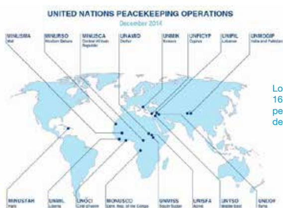
Locations of the 16 current UN peacekeeping deployments

There are currently 16 peacekeeping operations, across 4 continents, led by the DPKO. These include missions in the Western Sahara, Central African Republic, Mali, Haiti, Democratic Republic of Congo, Darfur, Syria, Cyprus, Lebanon, Abyei (Sudan), South Sudan, Côte d'Ivoire, Kosovo, Liberia, India and Pakistan, and the Middle East. The approved budget for the period from 1 July 2016 to 30 June 2017 equals about $7.87 billion, comprising less than 0.5% of total global military expenditure.