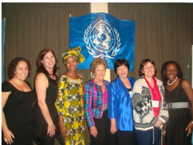
UNAA rural delegates