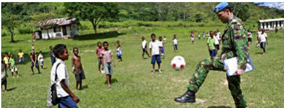
An officer from the UNMIT's Military Liaison Group plays football with children in Timor-Leste.

As of 31 March 2012, the workforce consisted of: 84,186 serving troops and military observers; 14,421 police personnel; 5,468 international civilian personnel (31 December 2011); 12,290 local civilian staff (31 December 2011) & 2,421 UN Volunteers. 117 countries contribute military and police personnel; as the UN does not have its own military force it depends on these contributions from Member States.