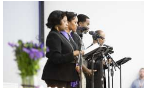
A reading by professional actors takes place during the memorial ceremony at UN Headquarters to mark the 18th anniversary of the 1994 genocide in Rwanda.

The "Lessons from Rwanda" exhibit is an excellent educational tool which has been shown in more than 15 countries around the world. It was launched at UN Headquarters in New York for the 13th commemoration of the Rwanda genocide and has been shown at venues such as the International Criminal Tribunal for Rwanda in Arusha, Tanzania, at a former World War II SS concentration camp in the Netherlands and at the Capetown Holocaust Centre in South Africa.