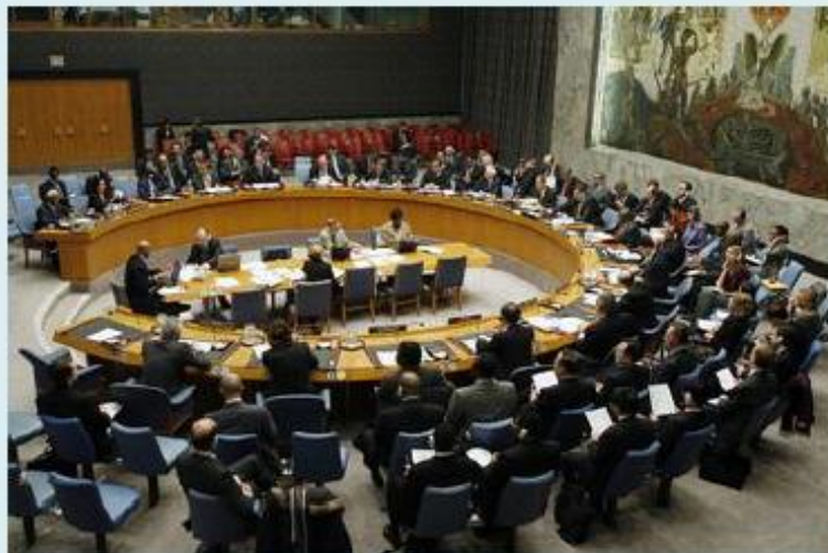
Photo: UN Security Council meeting, 2007.

UNAAWA - working towards a fair and sustainable world