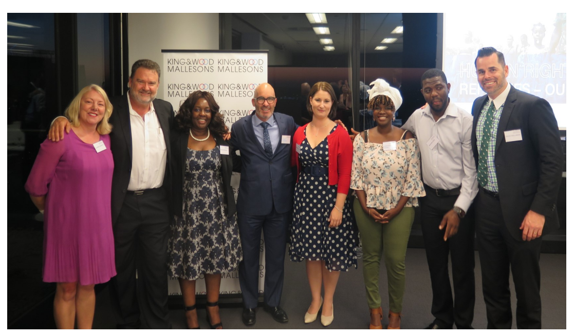
Guests and speakers at UNAAWA Human Rights Event.

1 www.mmrcwa.org.au/wp-content/uploads/2013/Refugees-in-WA-Settlementand-IntegrationFINAL.pdf