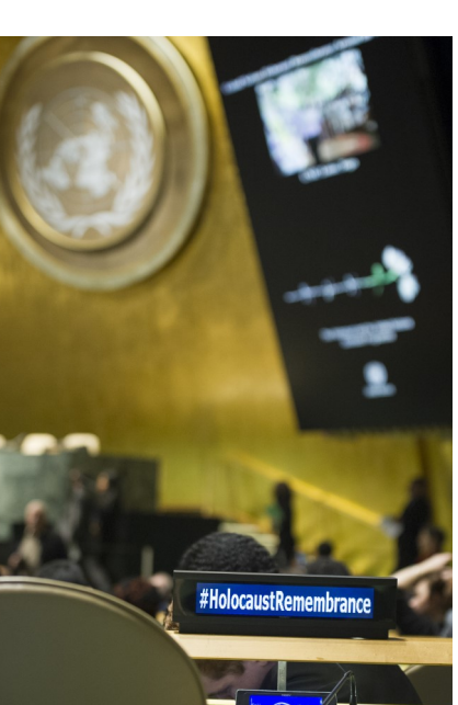
Commemoration in Memory of Victims of Holocaust

"Today is a day to remember, reflect and look forward. The world has a duty to remember that the Holocaust was a systematic attempt to eliminate the Jewish people and so many others. There is no better education for the future than the guarantee that we