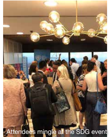
Attendees mingle at the SDG event