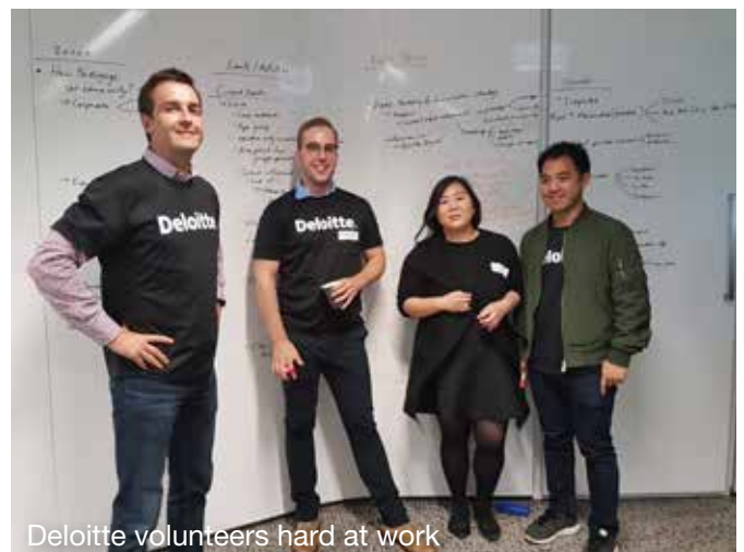
Deloitte volunteers hard at work

This was a highly successful event involving over 40 volunteers from Deloitte who met with several members of our Executive team for a full day, to provide assistance for broad range of topics. Following a brief presentation on the goals and objectives of UNAA, various project teams were formed to address topics such as membership growth, United Nations Day event options, a Model UN Conference and Annual Reporting.