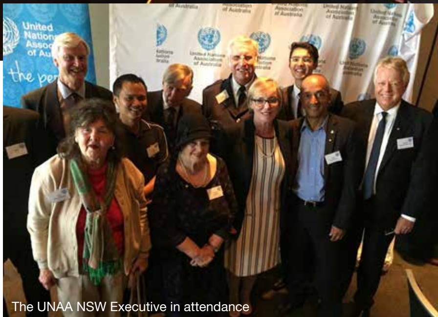
The UNAA NSW Executive in attendance