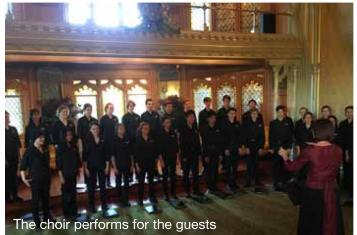
The choir performs for the guests