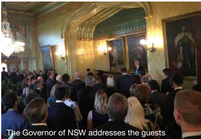
The Governor of NSW addresses the guests