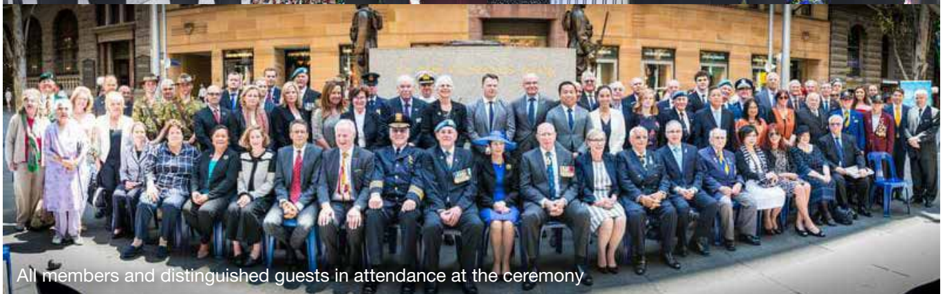
All members and distinguished guests in attendance at the ceremony