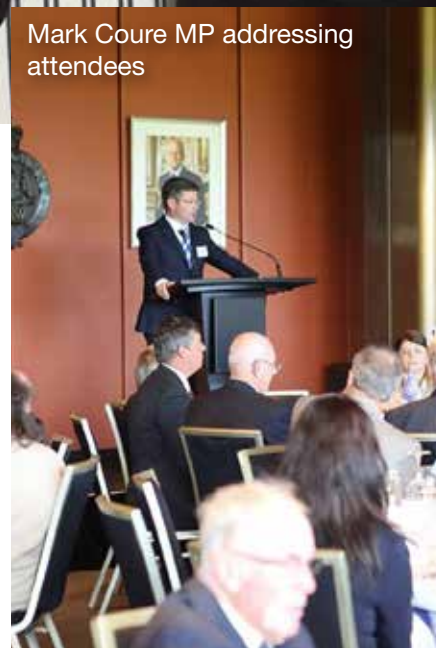
Mark Coure MP addressing attendees