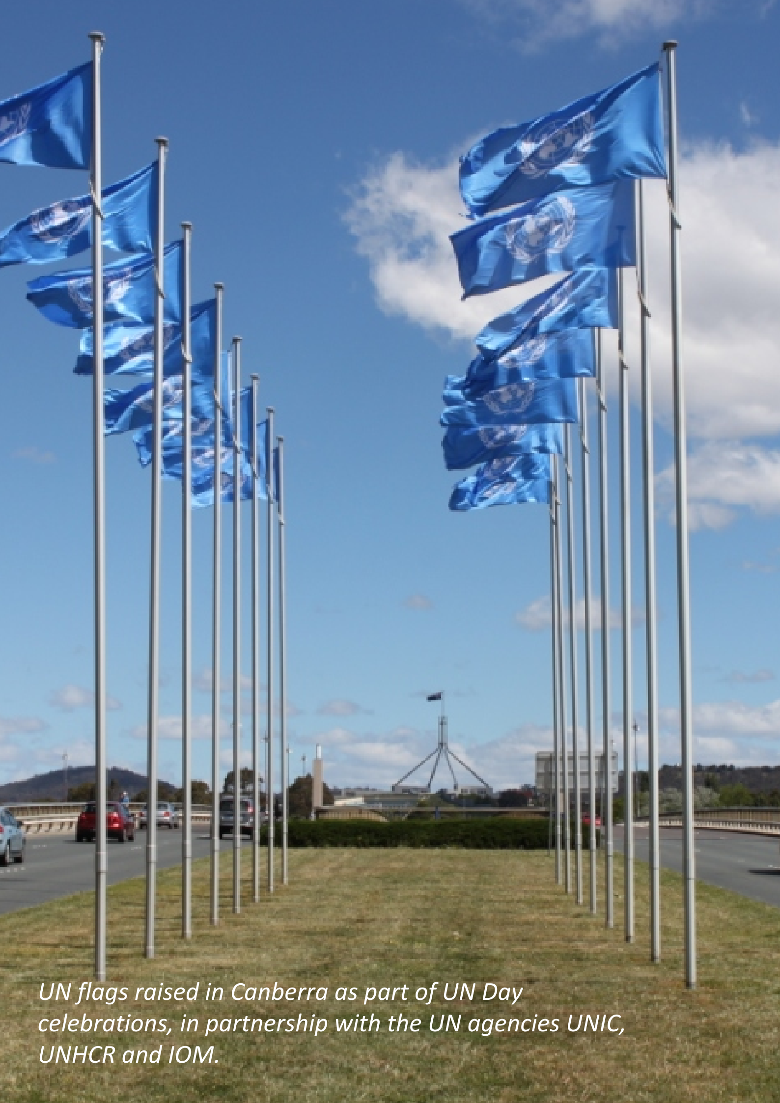
UN flags raised in Canberra as part of UN Day celebrations, in partnership with the UN agencies UNIC, UNHCR and IOM.