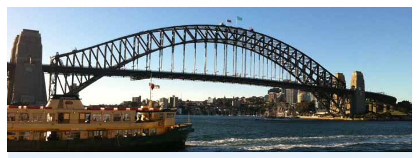
Flying the UN flag down the principal avenues of Canberra and on top of the Sydney Harbour Bridge to raise awareness of UN Day

Reaching over 12,000 fans on the United Nations Association of Australia Facebook page