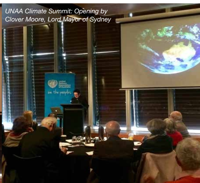
UNAA Climate Summit: Opening by Clover Moore, Lord Mayor of Sydney