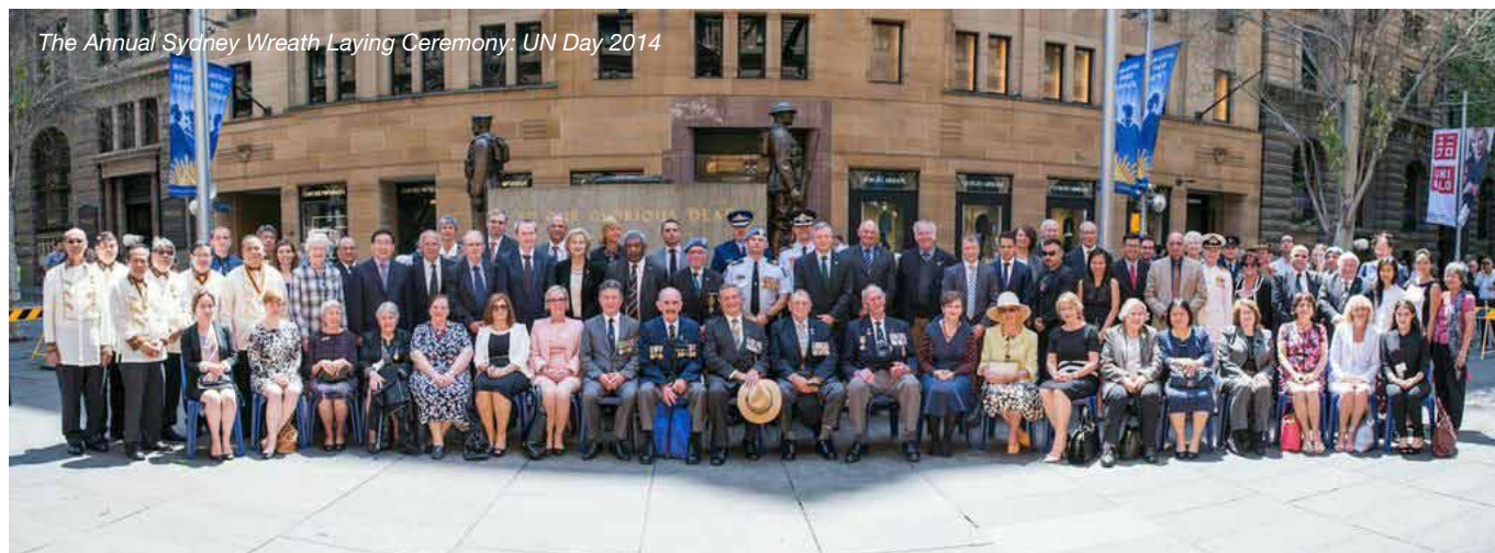
The Annual Sydney Wreath Laying Ceremony: UN Day 2014