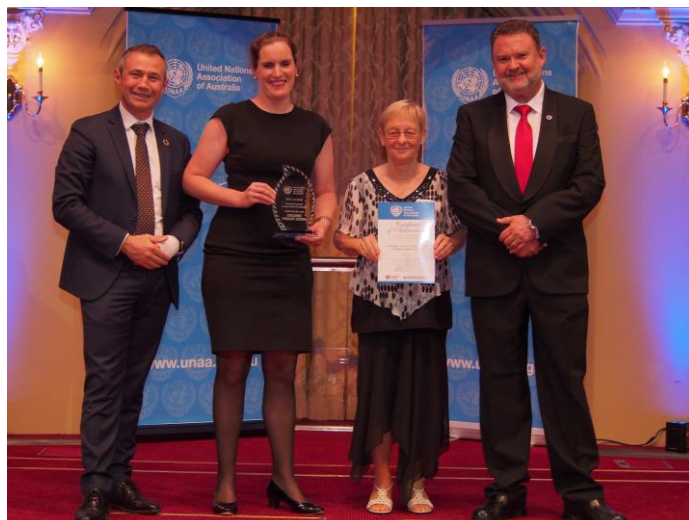
Representatives of Coolbinia Primary School staff receiving the 2017 Award at Government House

https://www.unaa.org.au/divisions/western-australia/wa-programs-for-schools/wa-world-teachers-day-awards/