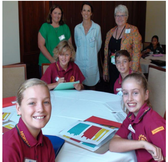
North Beach Primary School students worked with parent and community volunteers to design their Global Goals 'Mission'