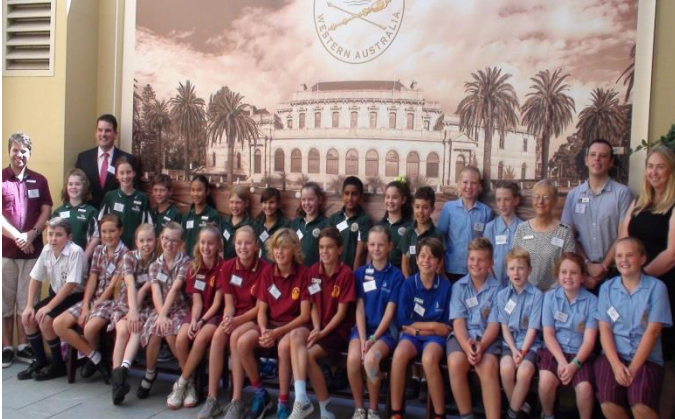
Some of the students and teachers at the 22 March Student Parliament

https://www.youtube.com/channel/UCLj9MxJwNwpOC2VKZljlphw?view_as=subscriber