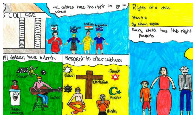
Ishaan Gopalan - 2018 Finalist Year 4 to 6 category

https://www.unaa.org.au/divisions/western-australia/wa-programs-for-schools/wa-yolande-frank-art-awards/