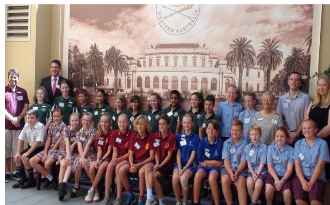
Some of the students and teachers at the 22 March Student Parliament

https://www.youtube.com/channel/UCLi9MxJwNwpOC2VKZlplhw?view_as=subscriber