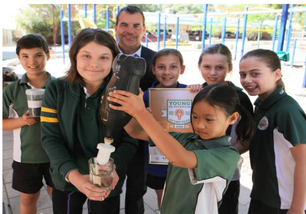
Coolbinia Primary School students with their prize-winning water filter

Finalists are invited to the award presentations at our Peace Day event on Sunday 20 September .