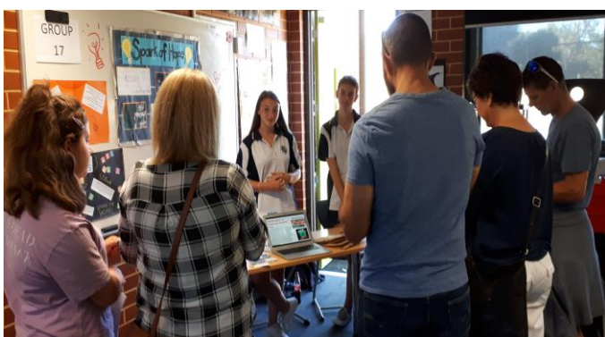
Spark of Hope Global Goals Project Pitch in action at Duncraig SHS Presentation Night

Representatives from Bold Park Community School, Duncraig Senior High School and Shenton College generously shared their learning. Diverse delivery strategies ranged from whole-school curriculum integration, through embedding in Year 10 HASS extension programs to a Year 10 STEM elective.