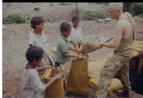
Filling sandbags with the locals whilst digging pits at Bobonaro.