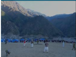
Playing cricket at a displaced persons camp at Maira, north west of the city Abbottabad in Pakistan.