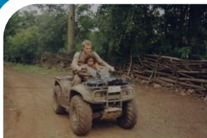
Taking the locals for a ride in Nefotele.